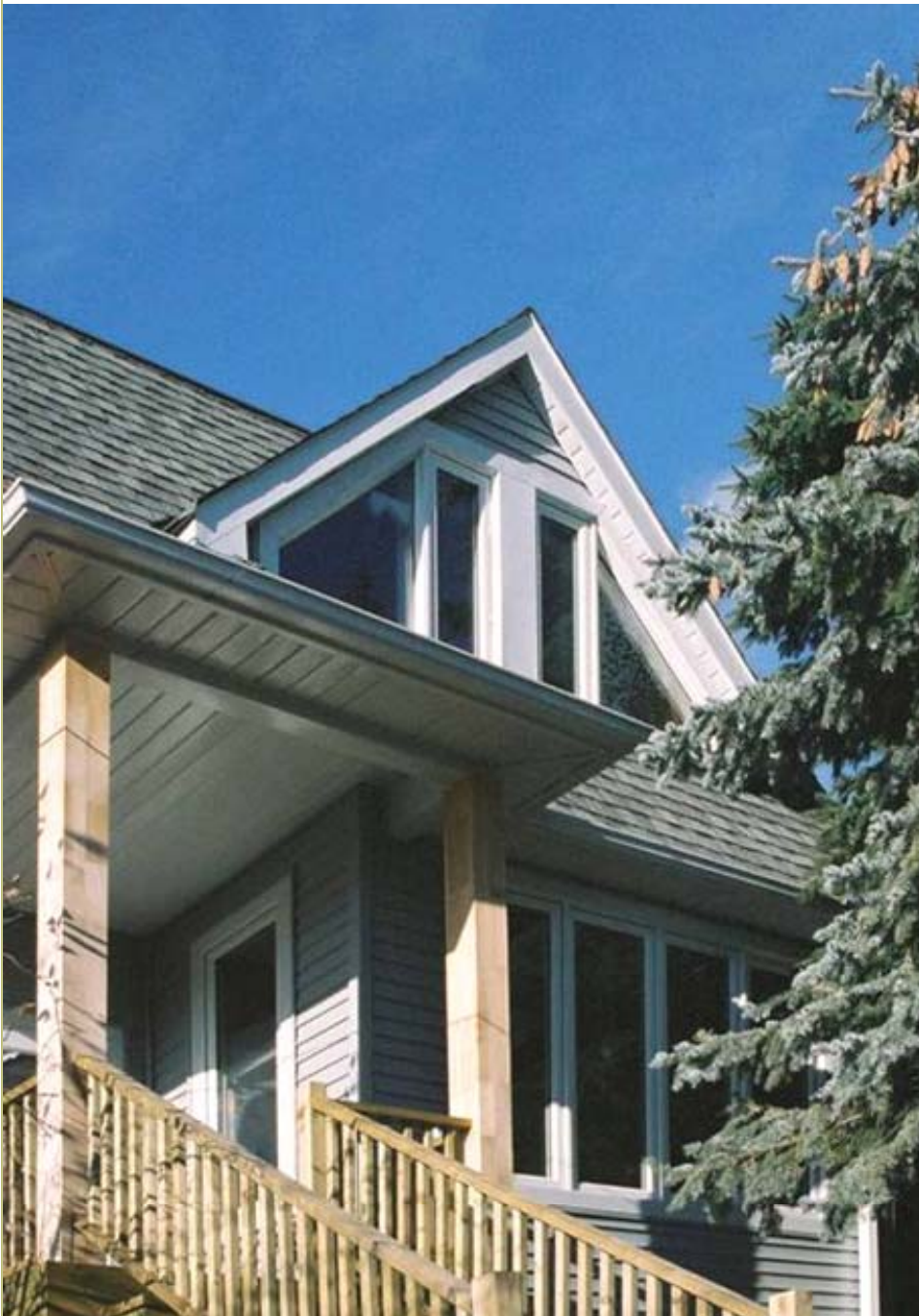
View of the house from the street