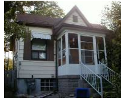
Before: a small bungalow overshadowed by tall and imposing cedar trees

The result was a grand, two-storey, high-ceilinged 1,600 sq. ft., 3-bedroom house with a fabulous open plan ground floor family area, a bright open feel and dynamite views out big new windows.